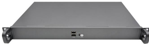
Rear Panel I/O View