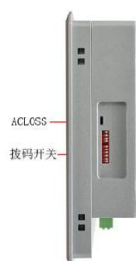
侧面 I/O 视图