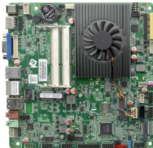
ITX-B673_I512L VER:1.0 主板正面图