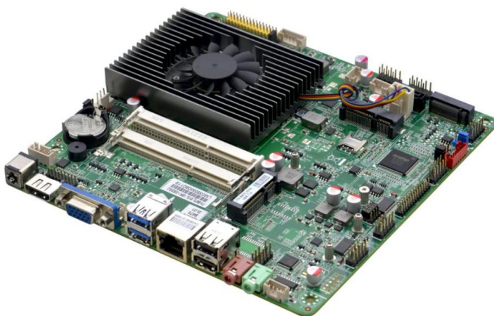
ITX-B673_I512L VER:1.0 主板侧面图