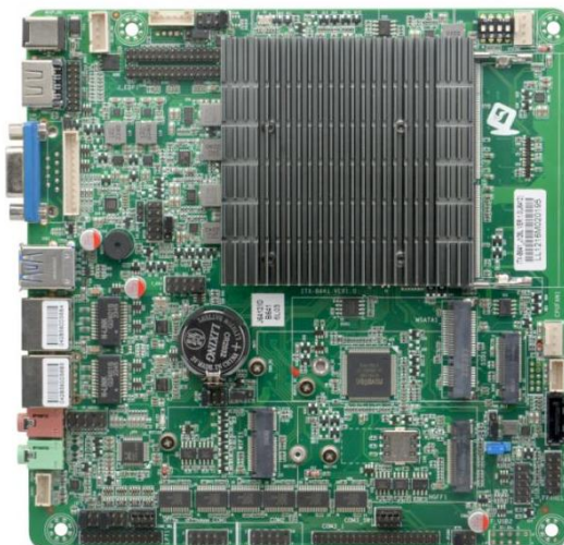
ITX-B641_J126L VER:1.1A 主板正面图