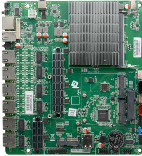
D41SL VER1.0 主板正面