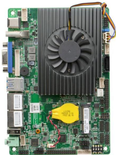
EPIC-E75_I522L VER1.0 主板正面图