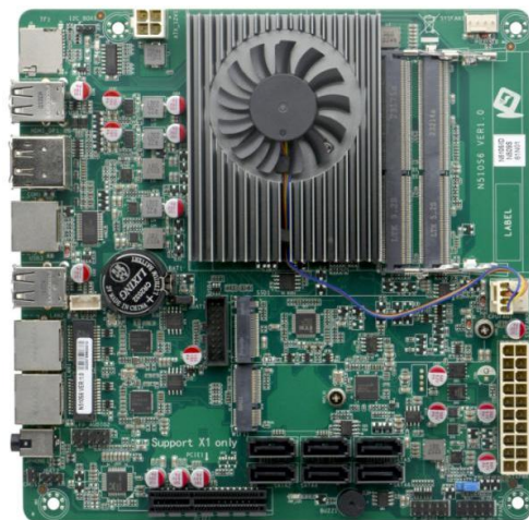
N510S6 VER:1.0 主板正面图